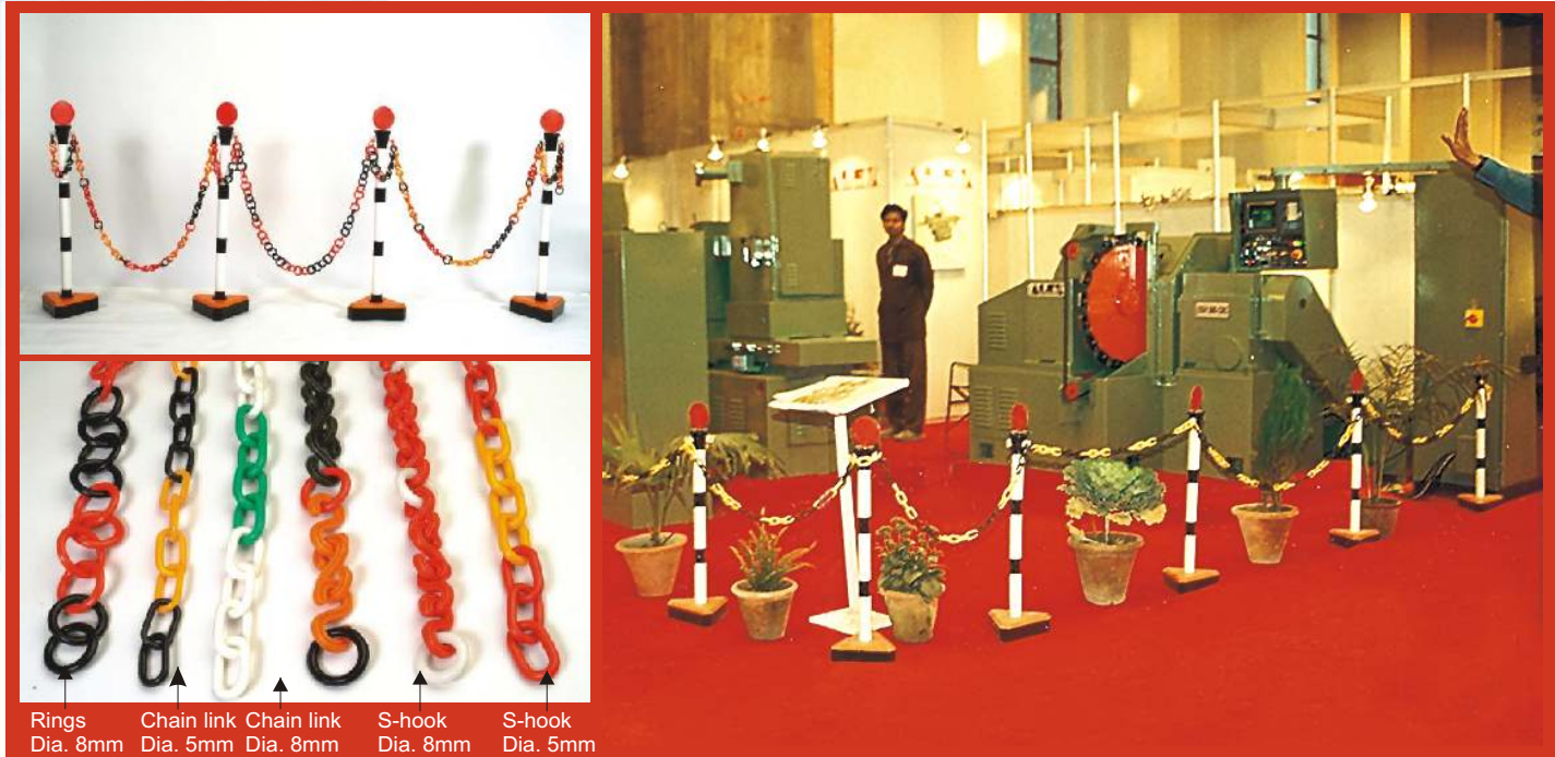
Rings Dia. 8mm Chain link Dia. 5mm Chain link Dia. 8mm S-hook Dia. 8mm S-hook Dia. 5mm

A reputation of any Organization depends upon the work environment, disciplined code of conduct and safety measures taken to avoid accidents. For this purpose importance of demarcation of various areas is necessary. We have developed Plastic StandPole and Chain for demarcation which is decorative as well, that enhances the aesthetics of your organisation.